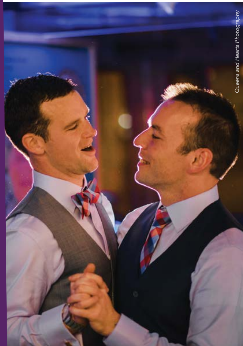
Queens and Hearts Photography